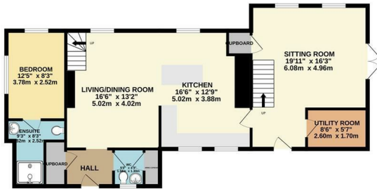
GROUND FLOOR 971 sq.ft. (90.2 sq.m.) approx.